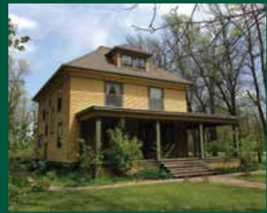
Buffalo-themed items, above left, support restoration efforts at the 1916 Buffalo High School. Also above are the Old Stone Church and Peterson House, among the 15 sites interpreted with historic markers.